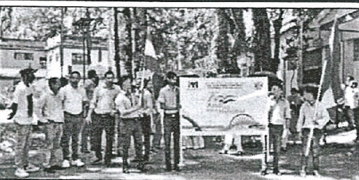
In order to celebrate Amrit Mahotsav of Independence, Industrial Training Institute Rangpo organized a four kilometre long walk rally from IIT Mining to Rangpo today with Har Ghar Tiranga slogan. The rally started from IIT and passed through Mining fatak, Rangpo fatak, Upper Bazar, Checkpost, Mandi Bazar and ended at Minto fatak