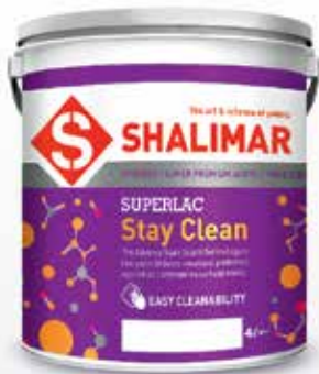
Superlac Interior Premium Acrylic Emulsion

Superlac Stay Clean is a water based super premium emulsion which provides Easy Stain Cleanability to household stains such as tea, coffee, ketchup etc. It is formulated with advanced stain guard technology which gives superior stain resistance to household stains.