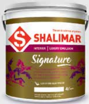
Signature Interior Luxury Emulsion

The toughness of pure acrylic binders fortified with fluoro polymers impart high level of inertness giving a long-lasting, luxurious and stain-free finish. Signature Luxury Emulsion has superior Bacterial & Fungus Resistance.