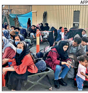
People wait to be evacuated from Afghanistan at the airport in Kabul on Wednesday

While thanking the US for the smooth evacuation of Indian diplomats, Harsh Shringla underlined India's main priority that it needed urgently to evacuate around 400 Indian nationals, and also Afghan nationals with ties to India, for which it wanted commercial flight operations to restart as soon as possible in Kabul. He sought the US' help in getting Indians to access the airport for reopening the commercial terminal. The Indian nationals still in Afghanistan chose to stay back despite repeated advisories by the embassy in the past couple of months about