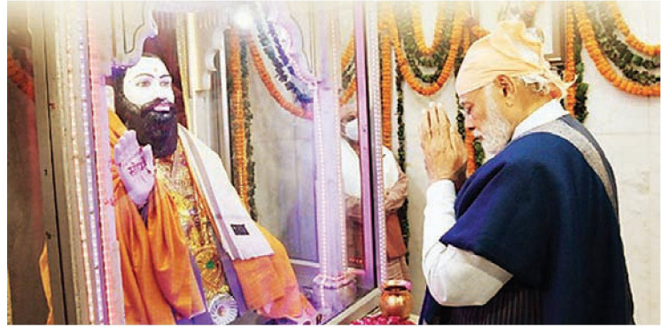
Team Absolute | Bhopal

Modi performs ground-breaking ceremony for the Sant Ravidas Memorial and Art Gallery in Sagar. Sant Shiromani Shri Ravidas was a symbol of social harmony. Kota-Bina double rail line dedicated to people