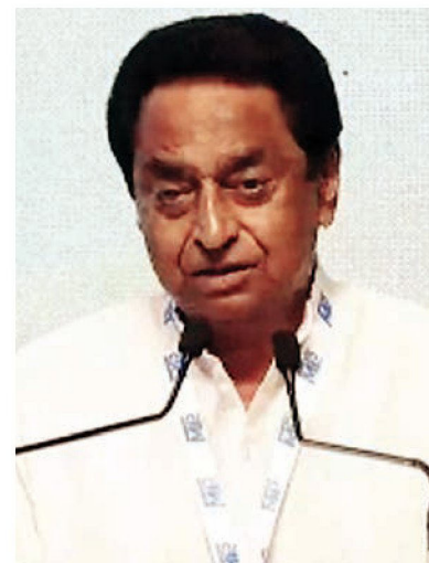
"In the interest of the public, the BJP government is requested to break the

Bhopal: Madhya Pradesh Congress president Kamal Nath on Saturday hit back at the ruling BJP, saying worried of losing the assembly polls, the saffron party has started questioning his "religious belief". In a series of tweets, Kamal Nath, the former chief minister, posted in Hindi: "Nowadays BJP people are more concerned about my faith and belief. The BJP leaders are coining new words like election worship and political hypocrisy and boast of breaking the spell of my magic, It suggest that nothing comes in the mind and heart of BJP people except me." "Instead of chanting my name, the government, its representatives and the BJP should chant the name of the people, worship people as in the country, public is 'Janardan'."