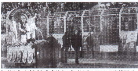
Prime Minister Narendra Modi with Goa Chief Minister Pramod Sawant during the opening ceremony of the 37th National Games at Parvati Jawahar Balli Stadium in Goa on Thursday.

PTI ■ MARGAO (GOA) Prime Minister Narendra Modi on Thursday said his government has increased expenditure on sports by three-fold in last five years, and re-emphasised that the country is prepared to host 2026 Olympics. Speaking after inaugurating the 37th National Games at Parvati Jawahar Balli Stadium in Margao, Modi said the Games are taking place in Goa at a time when Indian sports is reaching new heights.