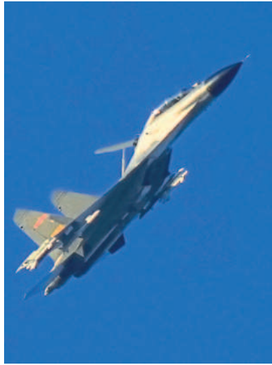
A Chinese J-11 military fighter jet flying above the Taiwan Strait near Pingtan, the closest land of mainland China.

From the South China Sea to the Himalayas, Beijing has shown a willingness to seize on perceived missteps by its rivals to tighten its grip over disputed territory. That's now playing out around Taiwan. In recent days, the People's Liberation Army has sought to establish a new status quo on Taiwan with a series of exercises in the wake of US House Speaker Nancy Pelosi's visit. The moves, including frequent trips across the US-defined median line in the Taiwan Strait and likely firing missiles over Taipei, have shrunk a vaguely defined buffer zone that has kept the peace for decades.