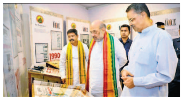
Union home minister Amit Shah with education minister Dharmendra Pradhan in Cuttack on Monday.

Modi started politics of performance and achievement instead of dynastic politics.