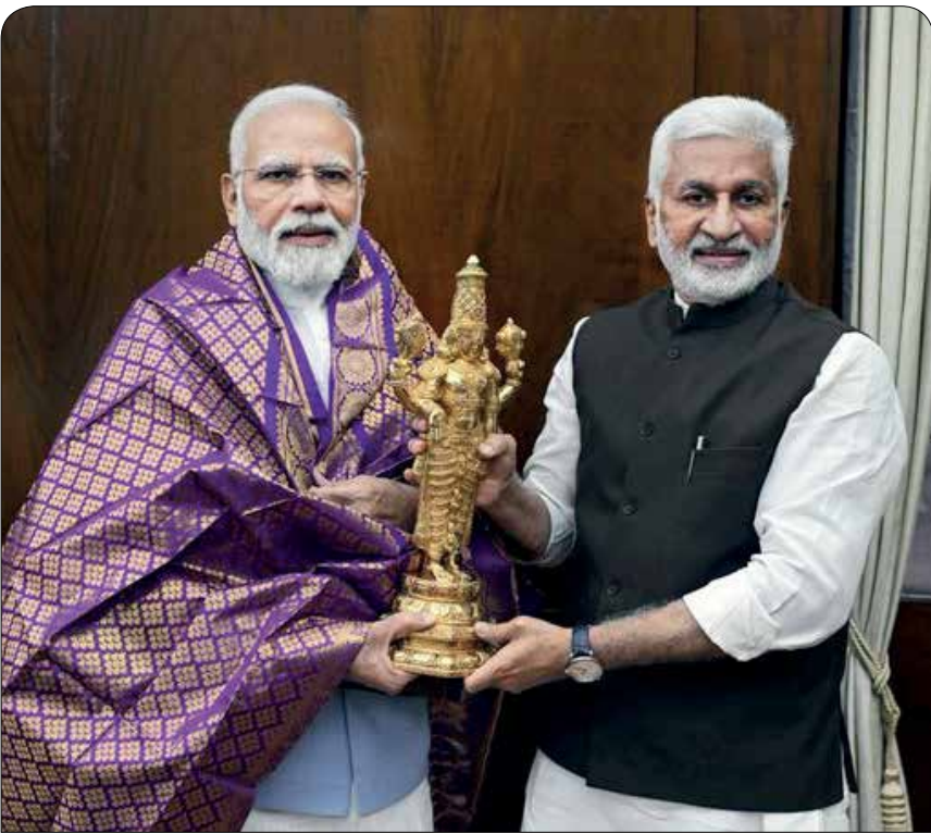
YSR Congress General Secretary and MP V Vijaysai Reddy meets Prime Minister Narendra Modi at his Parliament office on Monday where the duo discussed the successful completion of the NITI Aayog meeting as well as other pressing issues of Andhra Pradesh