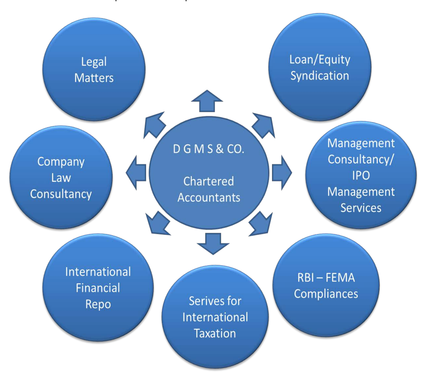
Figure 1 : Summary of Services being rendered

We are providing versatile services to our esteemed clients from the services for setting up of Business to Compliance with Governmental Authorities and Internal & System Audit services also. The mentioned below diagram denotes the summary of Services being offered by D G M S & CO., Chartered Accountants. Details are expressed to subsequent Para.