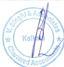
Director DIN : 01039198