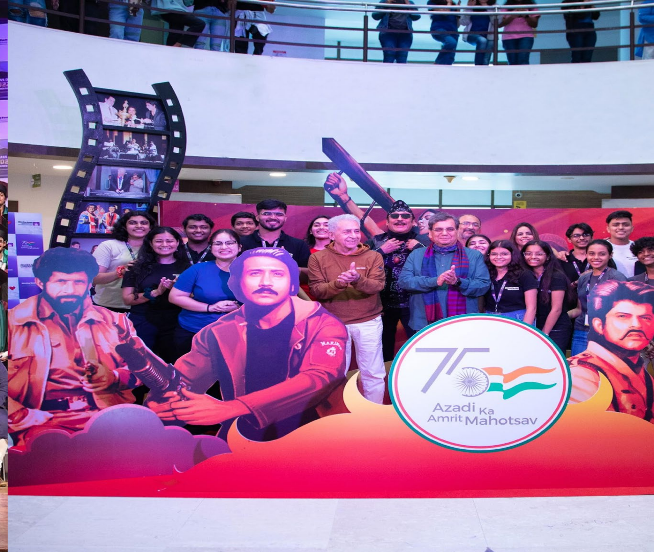
Celebrate Cinema: Celebrating 75 Years of India's Independence (Right)