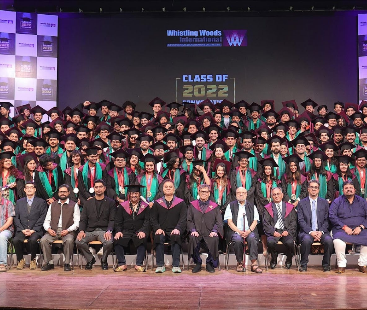
Whistling Woods International Convocation (Left)