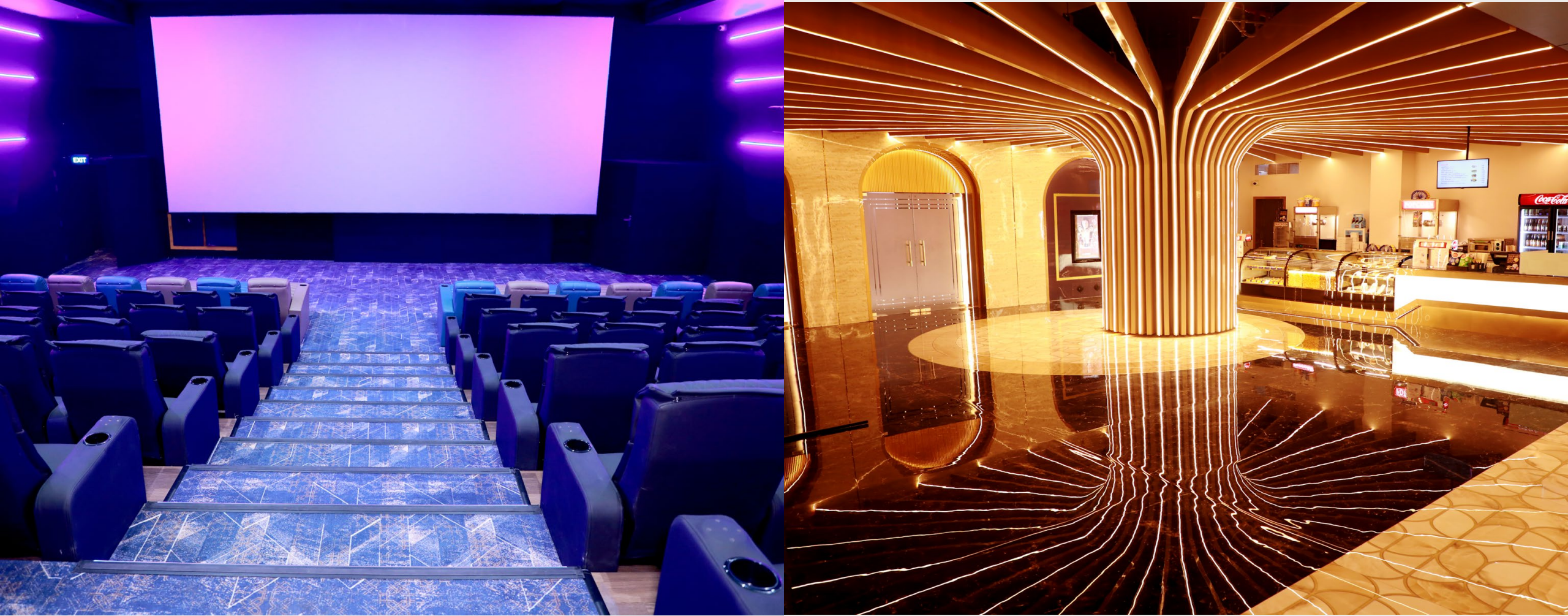
Mukta A2 Cinemas, Samastipur