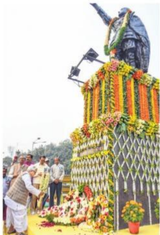
Left Front chairman Biman Bose pays tribute to Netaji Subhas Chandra Bose on his 123rd birth anniversary, in Kolkata, Thursday

West Bengal PCC president Somen Mitra too used the occasion to lash out at the BJP government at the Centre over CAA and the proposed NRC. "The BJP government at the Centre is unable to understand the princi-