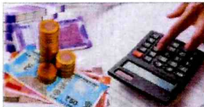
GREATER FISCAL TRANSPARENCY & QUALITY

Finance minister Nirmala Sitharaman and finance secre-