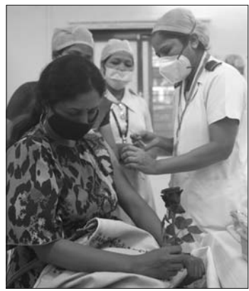
A healthcare worker holding a rose during the COVID-19 vaccine campaign, at a medical centre in Mumbai