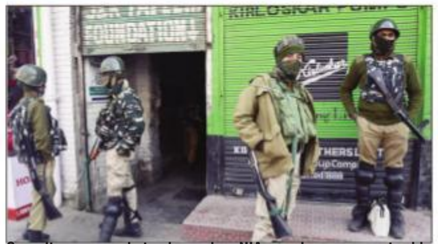
Security personnel stand guard as NIA members carry out raid at the Greater Kashmir office, in Srinagar on Thursday.