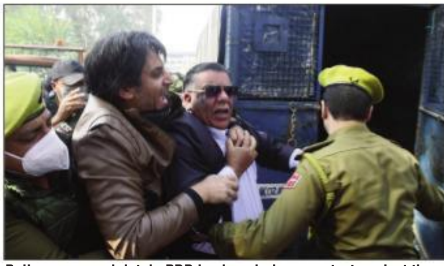
Police personnel detain PDP leaders during a protest against the recent notification of land laws outside PDP office, in Srinagar.