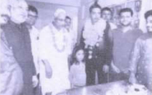
संविदा प्रसिद्धि ॥ भोजपुर