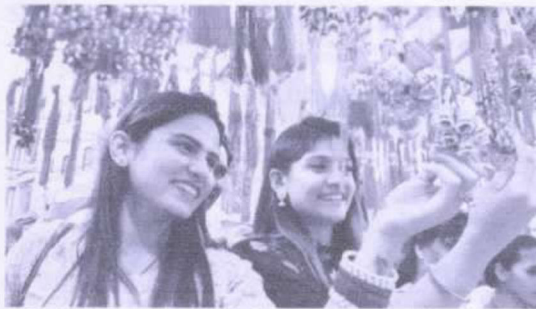
संविदा प्रसिद्धि ॥ भोजपुर