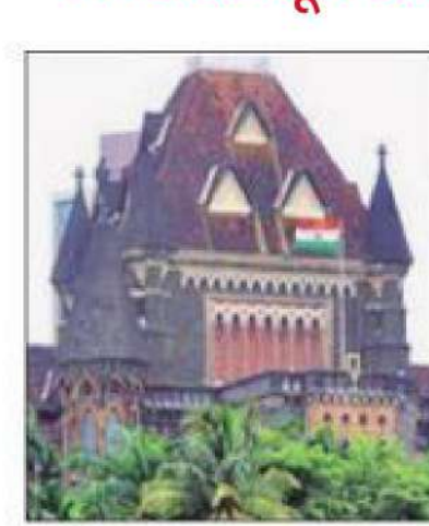
प्रत्येक पावसाळ्यापूर्वी रस्तेपाहणी का केली जात नाही, असा सवाल न्यायालयाने केला. महापालिकेने खडे आणि उघडा बुधारी गटारांची वेळीच पाहणी केल्यास ही समस्या उद्भवणार नाही, असे न्यायालयाने यावेळी सुचवले. त्याचवेळी वाहतूकयोग्य नसलेले रस्ते हे अपघातांचे कारण असल्याची टिपणी न्यायालयाने केली.