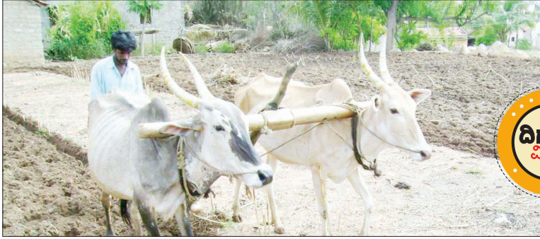
ಕೋಲಾರ ತಾಲೂಕಿನ ಅರಾಭಿಕೊತ್ತನೂರು ಗ್ರಾಮದ ಬಳಿ ರೈತರೊಬ್ಬರು ತಮ್ಮ ಜಮೀನನ್ನು ಮುಂಗಾರು ಹಂಗಾಮಿನ ಕೃಷಿ ಚಟುವಟಿಕೆಗಳಿಗೆ ಉಳುಮೆ ಮಾಡುತ್ತಾ ಬಿತ್ತನೆ ಕಾರ್ಯಕ್ಕೆ ಭೂಮಿಯನ್ನು ಸಜ್ಜುಗೊಳಿಸುತ್ತಿರುವುದು.

ಕಬ್ಬು, ಹತ್ತಿ ಸೇರಿದಂತೆ ವಾಣಿಜ್ಯ ಬೆಳೆಗಳನ್ನು 110 ಹೆಕ್ಟೇರ್ ಪ್ರದೇಶದಲ್ಲಿ ಬಿತ್ತನೆ ಗುರಿ ಹೊಂದಿದ್ದು, ಕೇವಲ 5 ಹೆಕ್ಟೇರ್ ಪ್ರದೇಶದಲ್ಲಿ