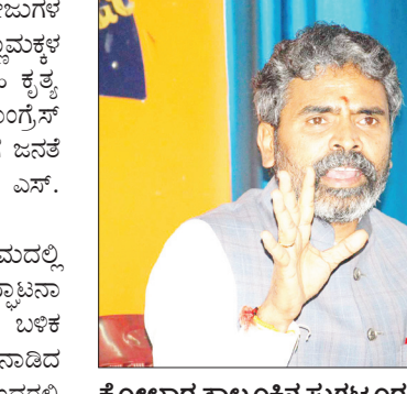
ಕೋಲಾರ ತಾಲೂಕಿನ ಸುಗಟೂರು ಗ್ರಾಮದಲ್ಲಿ ಸಂಸದ ಎಸ್. ಮುನಿಸ್ವಾಮಿ ಮಾಧ್ಯಮದೊಂದಿಗೆ ಮಾತನಾಡಿದರು.

ಕೋಲಾರ: ಶಾಲೆ, ಕಾಲೇಜುಗಳ ಶೌಚಾಲಯ ಗಳಲ್ಲಿ ಹಿಂದೂ ಹೆಣ್ಣುಮಕ್ಕಳ ವಿಡಿಯೋ ಚಿತ್ರೀಕರಿಸುವ ದೇಶದ್ರೋಹಿ ಕೃತ್ಯ ಎಸಗುವವರ ಪರ ನಿಲ್ಲುವ ರಾಜ್ಯದ ಕಾಂಗ್ರೆಸ್ ಸರ್ಕಾರದ ನಾಚಿಕೆಗೇಡಿನಂತೆ ವರ್ತನೆಗೆ ಜನತೆ ಛೇದನಾ ಕಾರ್ಯಕ್ರಮ ಎಂದು ಸಂಸದ ಎಸ್. ಮುನಿಸ್ವಾಮಿ ಆಕ್ರೋಶ ವ್ಯಕ್ತಪಡಿಸಿದರು.