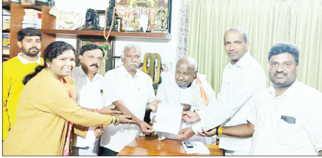
ಕೋಲಾರ ಎಪಿಎಂಸಿ ಮಾರುಕಟ್ಟೆಗೆ 36 ಎಕರೆ ಜಾಗವನ್ನು ಮಂಜೂರು ಮಾಡುವಂತೆ ಕೇಂದ್ರ ಅರಣ್ಯ ಸಚಿವ ಭೂಪೇಂದ್ರ ಯಾದವರಿಗೆ ಮಾಜಿ ಪ್ರಧಾನಿ ದೇವೇಗೌಡರು ಪತ್ರ ಬರೆದು ಒತ್ತಾಯಿಸುವಂತೆ ಸಿಎಆರ್ ಶ್ರೀನಾಥ್ ನೇತೃತ್ವದ ನಿಯೋಗ ಮನವಿ ಸಲ್ಲಿಸಿತು.

ಆದರೆ, ಜುಲೈ ತಿಂಗಳಲ್ಲಿ 2.24 ರೋಗಿ ಕಳೆದ 7 ದಿನಗಳಿಂದಲೂ 21.4 ಮಿ.ಮಿ ಮಳೆ ಸುರಿಯಲೇಬೇಕಾಗಿದೆ, ಕೇವಲ 7.7 ಮಿ. ಮಿ ಮಳೆ ಸುರಿದರೆ ಶೇ.64 ರಷ್ಟು ಮಳೆಯು ಕೊರತೆ ಎದುರಾಗಿದೆ. ಇಡೀ ಜುಲೈ ತಿಂಗಳಲ್ಲಿ 58 ಮಿ.ಮಿ ಮಳೆಯು ಸುರಿಯಬೇಕಾಗಿದೆ. ಕೇವಲ 32 ಮಿ.ಮಿ ಮಳೆ ಸುರಿದರೆ ಶೇ.46 ರಷ್ಟು ಪ್ರಮಾಣದ ಮಳೆ ಕುಂಠಿತವಾಗಿದೆ. ಮುಂಗಾರು ಹಂಗಾಮಿನ ಜೂನ್ ಮತ್ತು ಜುಲೈ ತಿಂಗಳಲ್ಲಿ ಒಟ್ಟು 124 ಮಿ.ಮಿ ಮಳೆಯು ಹಾಗಾದರೆ ಒಟ್ಟು 124 ಮಿ.ಮಿ ಮಳೆಯಾಗಿದ್ದು ಶೇ.4 ರಷ್ಟು ಮಳೆ ಕೊರತೆಯಾಗಲಿದೆ. 2023 ಜನವರಿಯಿಂದ ಈವರೆಗೂ ಕೋಲಾರ ಜಿಲ್ಲೆಯಲ್ಲಿ ಸರಾಸರಿ 240 ಮಿ.ಮಿ ಮಳೆಯಾಗಬೇಕಾಗಿದ್ದು, 332 ಮಿ.ಮಿ, ಶೇ.38 ರಷ್ಟು ಹೆಚ್ಚಿನ ಮಳೆಯಾಗಿದ್ದರೂ, ಮುಂಗಾರು ಹಂಗಾಮಿನ ಆರಂಭಕ್ಕಿಂತಲೂ ಮೊದಲೇ ಈ ಮಳೆ ಸುರಿದಿರುವುದರಿಂದ ಕೃಷಿ ಚಟುವಟಿಕೆಗಳ ಪ್ರಮಾಣ ಕಡಿಮೆಯಾಗಿದೆ ಎಂದು ಕೃಷಿ ಇಲಾಖೆಯ ಮೂಲಗಳು ತಿಳಿಸಿವೆ.