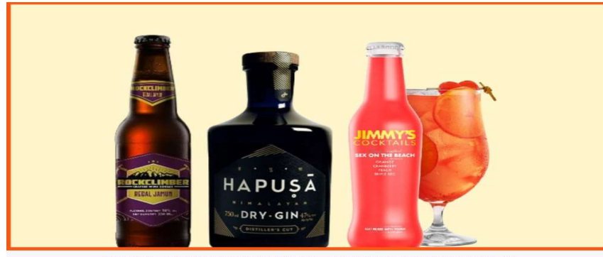
Nao Spirits, Jimmy's Cocktails, RockClimber - Alcoholic Beverage Companies in India

The global alcoholic beverages industry has seen positive volume and value growth following a turbulent few years. Tuning into the latest set of financial results from major alcoholic drinks players gives much reason for optimism – the trend towards premiumisation appears to