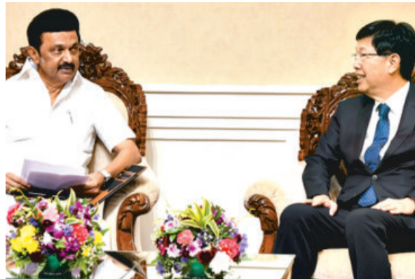
TN Chief Minister M K Stalin with Foxconn Group Chairman and CEO Young Liu, in Chennai on Monday

"Various investment opportunities in TN were discussed. We also discussed further