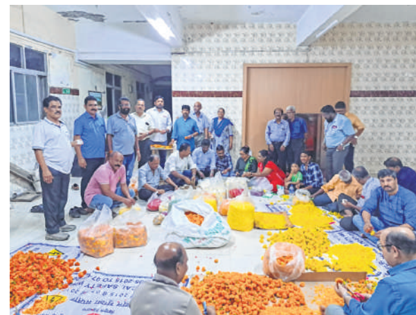
All Mumbai Malayali Association separating flower petals for Onam Pookalam at the Chhatrapati Shivaji Maharaj Terminus

People make elaborate Pookalam (flower patterns) outside their homes early in the morning. Though not necessary, many visit temples in traditional attire. Men wear "Mundu" or a silk dhoti women wear "Pamundu", a white silk saree with golden zari border. "We go to the temple mainly to seek blessings of Lord Guruvayoor and meet family and friends. It is