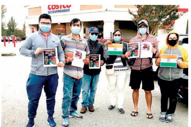
দলিত নিগ্রহের টেডে বিদেশেও। প্রতিবাদ জানাচ্ছেন মেমফিসের সেন্ট জুডস হাসপাতালের ভারতীয় চিকিৎসা-কর্মীরা।

করোনা-আহবের মধ্যে শুরু হয়ে গেছে দুর্গাপূজার প্রস্তুতি। শুরু হয়ে গেছে কেনাকাটা। নিউমার্কেট, গড়িয়াহাট, হাতিবাগান, শ্যামবাজারে পূজো বাজারে তিউ ও বাড়ছে।