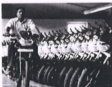
IN TOP GEAR Historical trend in the domestic sales ratio of two-wheelers to passenger vehicles

Two-wheelers have turned out to be a better bet for auto makers, compared to passenger cars and sports utility vehicles (SUVs). Sales of passenger vehicles (PVs), including SUVs, had declined to a four-year low of 2.43 million in FY20 even as the two-wheeler market grew 9 percent between FY16 and FY20. In FY20, domestic PV sales slid 22 per cent year-on-year (YoY) to 2.65 million units, while two-wheeler sales declined 18 per cent YoY to 1.74 million.