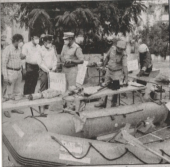
லுவலக வளாகத்தில் இன்று சர்வதேச பேரிடர் இன்னல் குறைப்பு மற்றும் மீட்பு பணிகள் துறையின் மூலம் பேரிடர் காலங்களில் குறித்த ஒத்திகை நிகழ்ச்சியை மாவட்ட வருவாய் அலுவலர்