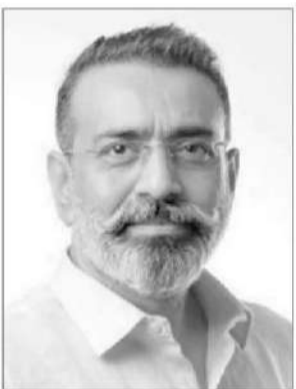
कानाकोपरा त्यांना माहिती आहे. नागरिकांच्या समस्या माहिती आहे. त्यामुळे स्थानिक स्वराज्य संस्थेचे प्रशासकीय अधिकारी म्हणून आयुक्तांनी प्रत्येक जनप्रतिनिधींशी