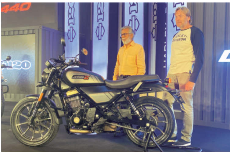
Pawan Munjal (left), executive chairman, Hero MotoCorp, with Jochen Zeitz, president & CEO, Harley-Davidson, at the launch of X440 earlier this week

This market dominance is likely to be shaken — as is already evident in the way the share prices have skidded during the week — Eicher Motors stock has slipped by 10.4 per cent since Monday, while Hero MotoCorp stock has gained