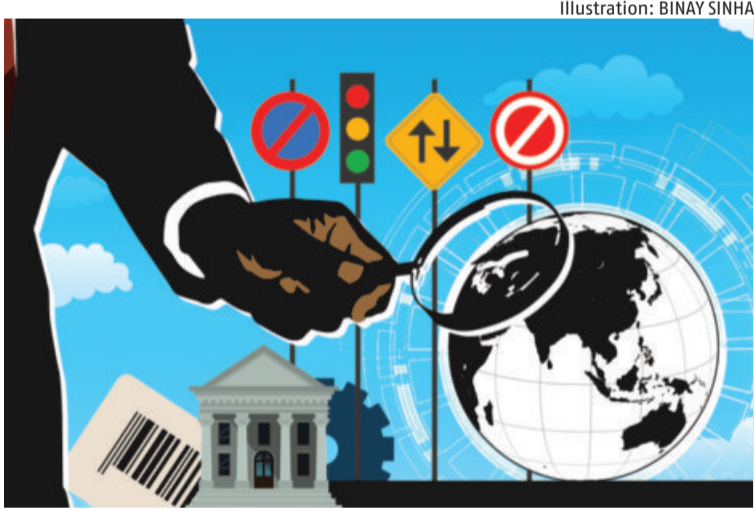
Illustration: BINAY SINHA

The present crisis demonstrates the global regulators' tendency to "fight the last war" rather than