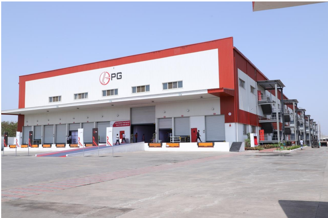
Image: Flagship Integrated AC Manufacturing Facility