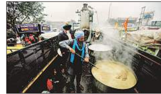
The 15-foot-tall steam boiler at Singhu border. Praveen Khanna