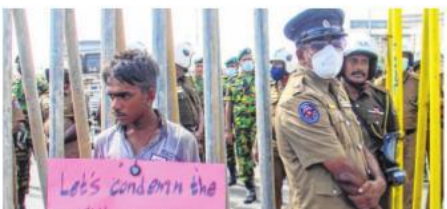
An anti-government demonstrator holds a placard during a protest near Presidential Secretariat in Colombo on Monday.

The Secretariat resumed operations under a tight security cover, they said.