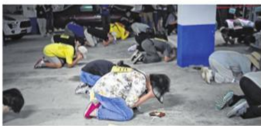
Local residents take shelter during a drill in Taipei on Monday.

Air raid sirens were sounded in the capital Taipei and the military was holding its annual multi-day Han