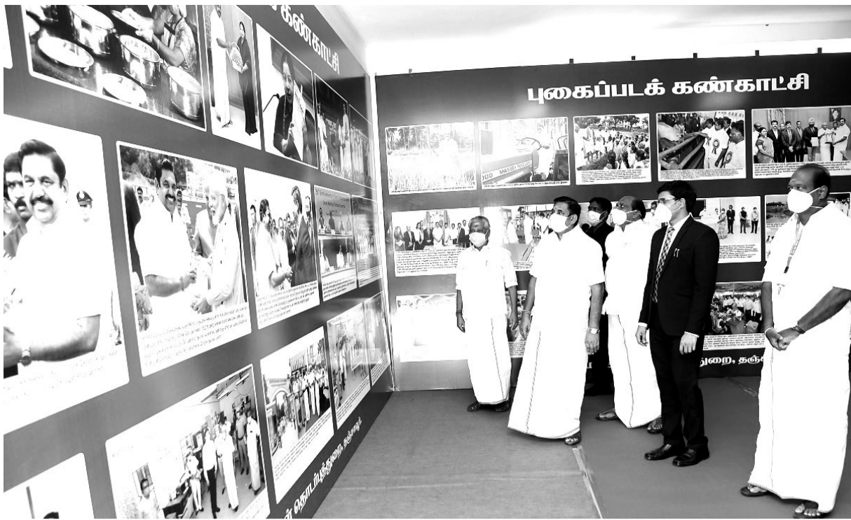
Chief Minister Edappadi Palaniswami inaugurated the photo exhibition of government achievements at the Thanjavur collectorate. Agriculture Minister, R. Doraikkannu, Collector M. Govinda Rao, Vaidyalingam MP and officials participated in the meeting.