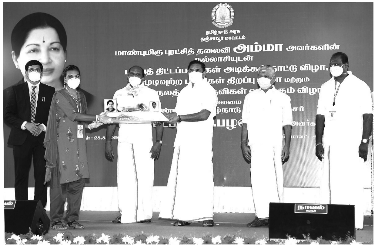
Chief Minister Edappadi Palaniswami distributed welfare assistance worth Rs. 42 crore under various schemes in Thanjavur district.