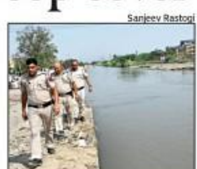
KEEPING ILLEGALITY AT BAY: Personnel from six police stations have been deployed to check water theft. FIRs will be filed against those caught stealing

New Delhi: Delhi Police have started a drive against the water mafia allegedly stealing water from Munak canal. While personnel from six police stations have been deployed to check water theft, police have also started extensive patrolling on the banks. On Thursday, a confidential report was prepared by the police and shared with lieutenant governor V K Saxena and the police commissioner, sources said. The police's report comprised information about how Munak canal was being monitored and intelligence being gathered against people supposedly involved in water theft. Since Wednesday, police were seen patrolling on bikes and SUVs. An officer said that water flows from Haryana via Narela, Shahbad Dairy, Samaypur Badli and Bawana. The areas are being constantly checked. The policemen will monitor the canal in three shifts. Pickets are also being set up. "We have deployed staff here. Around 120 policemen will monitor Munak canal 24 hours a day. If anyone is