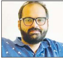
Comedian Kunal Kamra