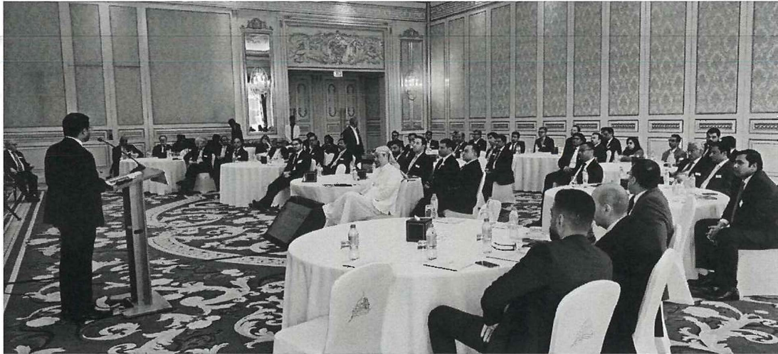
A full house: senior transaction bankers from across the Middle East learning first hand from the personal journey of an alumnus of the School since graduating from the program.