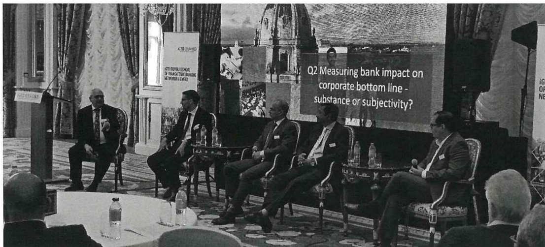
One of the key highlights of the evening: the corporate panel discussion that explored how businesses select their banks and the impact of digitization on product servicing.