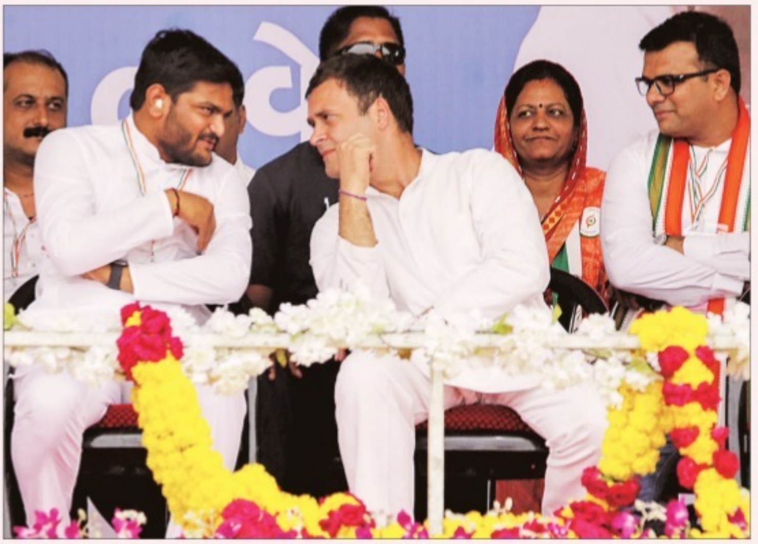
Congress president Rahul Gandhi with Patidar leader Hardik Patel at a rally in Asarana village of Gujarat's Bhavnagar district on Monday.