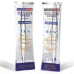
Business today/YES bank Excellence Awards-2013