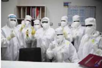
PNB ■ NEW DELHI

Modi pays tributes to doctors who lost lives while treating Covid patients