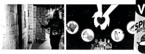
The biscuit brand Parle-G reassured customers with a film about its packaging process, Flipkart has stepped up its advertising around sustainable packaging and Colco Vio promises clean packaging

With safety and hygiene emerging as primary concerns in a pandemic, brands turn to packaging and presentation to gain consumer trust and confidence