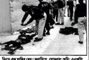
নিবৃত্ত এক জমির মেহে। কন্নামিত, সোমবার।