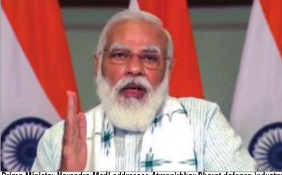
Prime Minister Narendra Modi addresses Atmanirbhar Bharat defence industry outreach webinar via video conference, in New Delhi, on Thursday

Addressing the Defence Industry Outreach Webinar organised by Federation of Indian Chambers of Commerce and Industry (FICCI) and Defence Ministry, he said self-confidence in the defence sector is very important for making an Atmanirbhar Bharat (self-reliant India). Defence Minister Rajnath Singh and Chief of Defence Staff (CDS) General Bipin Rawat also took part in the event. The Prime Minister said that the size of procurement orders from the domestic industry is going to increase in the coming days. "For many years, India