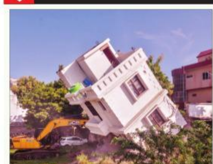
Authorities demolish an illegal building allegedly belonging to gangster-turned-politician Mukhtar Ansari, during an encroachment drive, in Lucknow, on Thursday