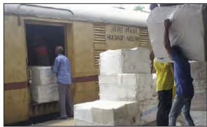
During the crisis arisen due to Covid-19, Western Railway is ensuring its best possible efforts, that there is no break in supply of essential commodities. Hence WR's parcel special trains are traversing

across the country to keep the supply moving. Since the time of lockdown to contain the spread of the Coronavirus, it is a moment of big achievement that Western Railway has crossed the figure of 500 Parcel special trains by running total 504 Parcel special trains during lockdown, to different parts of the country to transport about 1.11 lakh tonnes of various essential commodities. In continuation to this, on 31st August, 2020 six parcel special trains, including a milk rake left from various stations of WR. These included 3 parcel specials viz Bandra Terminus to Jammu Tawi, Porbandar to Shalimar and Dewas to New Delhi; 2 indent rakes one from Karambeli to New Guwahati and the other from Kankaria to Benapol and a milk special rake from Palanpur to Hind Terminal.