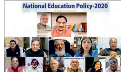
Dr. Ramesh Pokhriyal 'Nishank', Minister of Education, Govt. of India inaugurated an International Webinar on National