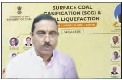
India's target to gasify 100 million tonnes of coal by 2030 will entail an investment of over Rs 4 lakh crore, Coal Minister Pralhad Joshi said. "Coal gasification and liquefaction is no more an aspiration,

but a requirement. For encouraging use of clean sources of fuel, government has provided for a concession of 20 per cent on revenue share of coal used for gasification. This will boost production of synthetic natural gas, energy fuel, urea for fertilisers and production of other chemicals," Joshi said. Joshi was addressing a webinar on coal gasification and liquefaction organised by the coal ministry. This 100 MT coal gasification will happen in three phases. In the first phase - from 2020-2024 - 4 million tonnes (MT) of coal will be gasified and around Rs 20,000 crore will be invested for the same.