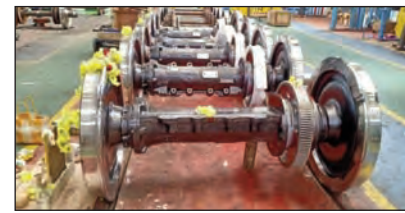
Mysuru Workshop of South Western Railway was established in 1924 as a base workshop of the erstwhile Mysore State Railway. The work shop has started

POH of BG coaches from 1994. With the introduction of LHB coaches on Indian Railways, workshop has been nominated to carry out Shop Schedule-1, Shop Schedule -2 and Shop Schedule -3 Schedules for the LHB coaches from 2012 onwards. Recently, Bharat Earth Movers Limited (BEM) had sought Mysuru Workshop to manufacture the 900 Trailer Coaches Wheel sets for 225 Trailer Coach Cars and 300 Motor Coach Wheel Sets for 75 Motor Coach Cars. BEM is manufacturing MEMU coaches for 8 car formation with Bombardier Propulsion System to ply between Ghaziabad and Delhi region. All the required Material including drill bits have to be supplied by BEM at their cost. The work consists of machining and pressing of wheel and Axle Assy.