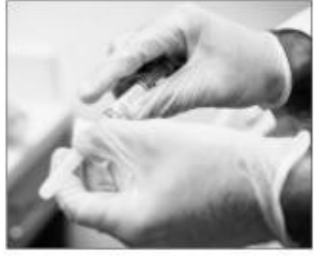
eral Tushar Mehta.

While speaking to reporters during the inauguration of a