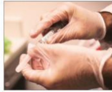
eral Tushar Mehta.

"Regarding pricing on vaccination different manufacturers are quoting in different prices. What is the central government doing about it? There are powers under the Patents Act. This is a pandemic and a national crisis. If this is not the time to issue such powers, what is the time?" Justice Bhat asked Solicitor Gen-