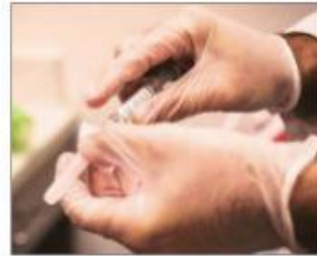
eral Tushar Mehta.

"Regarding pricing on vaccination different manufacturers are quoting in different prices. What is the central government doing about it? There are powers under the Patents Act. This is a pandemic and a national crisis. If this is not the time to issue such powers, what is the time?" Justice Bhat asked Solicitor Gen-