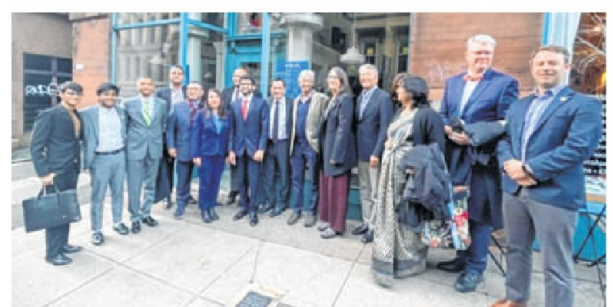
Aaditya Thackeray had showcased his climate action plan in presence of 260 state governments at COP26 in Scotland recently

The officials of Sanjay Gandhi National Park (SGNP) and the forest department have teamed up with a group of wildlife biologists. They have already radio-collared two leopards earlier this year and named them as Savitri (on Savitri bai Phule) and Chhatrapati (on Chhatrapati Shivaji Maharaj). C33 is the third leopard to be radio-collared under this project and will throw more light on her movements. The forest department is also contemplating officially naming her. Besides this in an event of a leopard attack in Aarey in the future, whether C33 was near the spot at the time of the attack will be tracked through radio collar, making it easier for the officials to zero down on the problem leopard, Forest Department officials said.