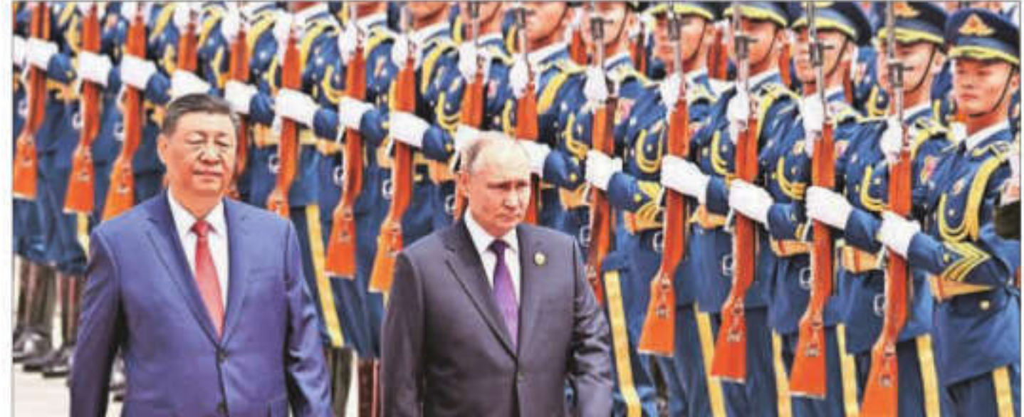
Chinese President Xi Jinping with his Russian counterpart Vladimir Putin during the latter's welcoming ceremony in Beijing, on Thursday

Xi also took a veiled swipe at the US, saying that "unilateral hegemony, confrontation and power politics threaten global peace and all countries' security."