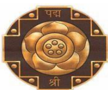
Padma Shri Awarded in 2010