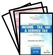
Author Professional Books. Academician.