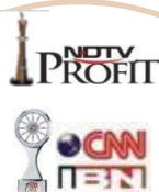
Awards NDTV 'Business Leadership Award', CNN IBN 'Indian of the year' - 2009