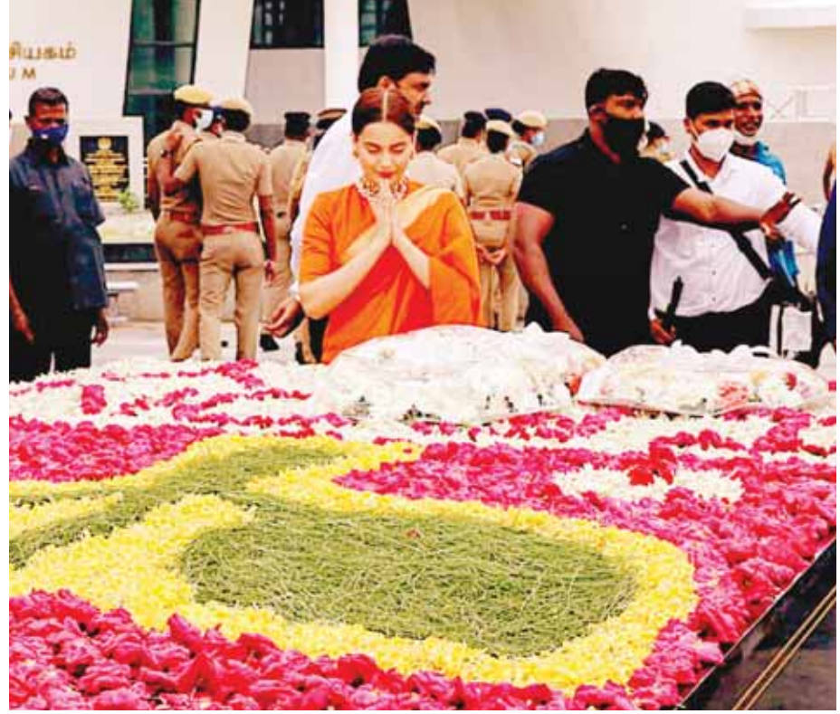
चेन्नई में जे. जयललिता के स्मारक पर श्रद्धांजलि अर्पित करती बॉलीवुड अभिनेत्री कंगना रनौत

यात्रा के दौरान उन्होंने कहा था कि कांग्रेस की गोवा इकाई विधानसभा की सभी 40 सीटों पर लड़ने के लिए तैयार हो रही है और उन्होंने यह भी दावा किया था कि राज्य में राजनीतिक माहौल पार्टी के लिए बहुत अनुकूल है। इस बीच, कांग्रेस की गोवा इकाई के अध्यक्ष गिरिश चौडानकर ने कहा, पार्टी अगले साल के चुनावों के लिए रणनीति बनाने की योजना बना रही है। हम राज्य के सभी बूथों पर फिर से काम कर रहे हैं। उन्होंने कहा, कई नेता गोवा में कांग्रेस में शामिल हो रहे हैं क्योंकि वे पार्टी को भारतीय जनता पार्टी (भाजपा) के खिलाफ एक उम्मीद के रूप में देखते हैं। लोगों ने राज्य में अगले चुनाव में भाजपा को हराने का फैसला किया है और माहौल कांग्रेस के पक्ष में है। गौरतलब है कि 2017 के गोवा विधानसभा चुनाव में कांग्रेस ने 40 सदस्यीय सदन में सबसे अधिक 17 सीटें जीती थीं।