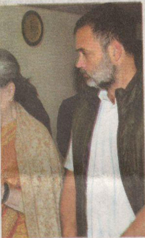
nomination for the Rajya iders Rahul Gandhi, Ashok

On arriving at Election Office in Rajasthan Vidhan Sabha, Ms Gandhi, Rahul Gandhi, and Ms Vadra were extended warm welcome and felicitated in Rajasthani style in "Opposition lobby" by party MLAs and top state leaders.