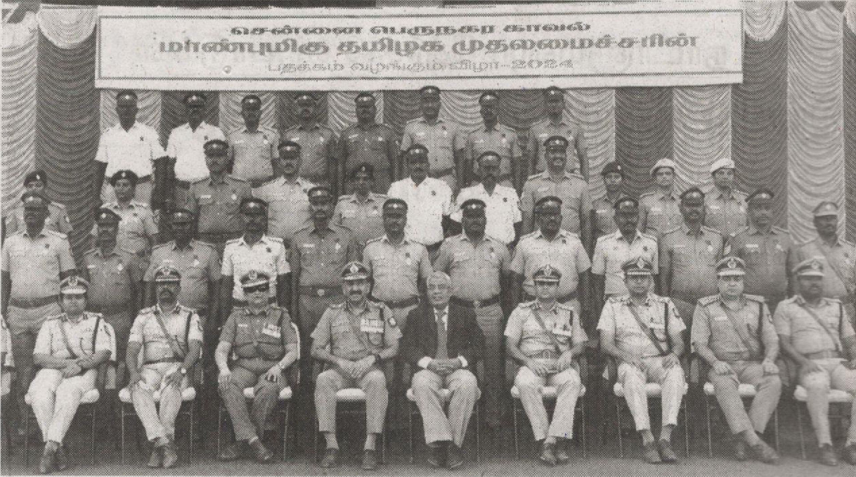
சென்னை பெருநகர காவல் துறையில் சிறப்பாக பணிபுரிந்த சென்னை பெருநகர காவல்துறையைச் சேர்ந்த 473 காவலர்கள் மற்றும் இதர சிறப்பு பிரிவுகளைச் சேர்ந்த 84 காவலர்கள் என மொத்தம் 557 காவலர்களுக்கு முதலமைச்சர் காவல் பதக்கங்களை கமிஷனர் சந்தீப்ராய் ரத்தோர் வழங்கினார். காவல்துறை இயக்குநர் அபய்குமார்சிங், காவல்துறை கூடுதல் இயக்குநர் (இரயில்வே) வி.வனிதா, கூடுதல் ஆணையாளர்கள் பிரேம் ஆனந்த் சின்ஹா, ஆர்.சுதாசு (போக்குவரத்து), கபில்குமார் சி சரட்கர் (தலைமையிடம்) உள்பட பலர் கலந்து கொண்டனர்.

பு. திருவள்ளூர், மம் 2024. ஊராட்சி ஒன்றியம்-பாப்பாள் 3/8Pt, 23/9Pt, 24/15Pt, யோக நிலப்பயன்பாடு, சர்வே, 6/12, 6/13, 6/14, 6/15, /8A, 20/8B, 20/9, 20/10, /21/5B, 21/6, 21/7, 21/8, /9, 22/10, 22/11, 22/12, t, 23/8Pt, 23/9Pt, 23/10, 19, 23/20, 23/21, 23/22, 4, 24/5, 24/6, 24/7, 24/8, 24/18, 24/19Pt, 24/20Pt, 8, 25/9, 25/10, 25/11Pt, /4, 27/5, 27/6, 27/7, 27/8, 11, 28/12, 28/14, 28/15, ர்ப்பு 48.30 ஏக்கர் இடத்தினை, ாலை மற்றும் ரயில்வே நில சிறப்பு மற்றும் அபாயகரமான Industrial use Zone) முழு பாதா மக்கள் வருக்களும் ர தெரிவிக்க விரும்புவோர் முகவரிக்கு நேரிலோ அல்லது