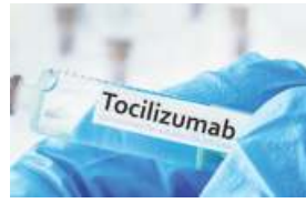
levels in patients critically ill with Covid-19," explained WHO.

"Tocilizumab is a monoclonal antibody that inhibits the Interleukin-6 (IL-6) receptor. Interleukin-6 induces an inflammatory response and is found in high