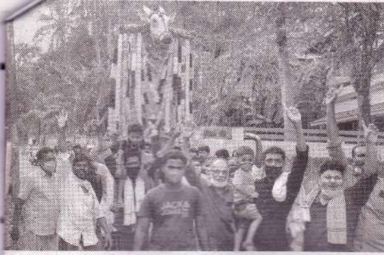
പുത്തനാൽക്കൽ കാളവേലയുടെ ഭാഗമായി ക്ഷേത്രം ഭാഷിക്കുന്നവർ നിയമിത നിന്നുള്ള ഒരു കാള ക്ഷേത്രത്തിലേക്ക് എഴുന്നള്ളുന്നു