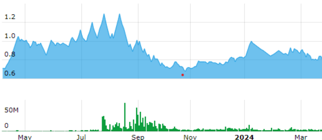
Stock Performance FY 2023-24

The performance of the Company's stock prices is given in the chart below: