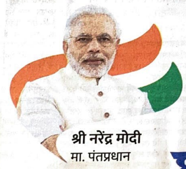
श्री नरेंद्र मोदी मा. पंतप्रधान