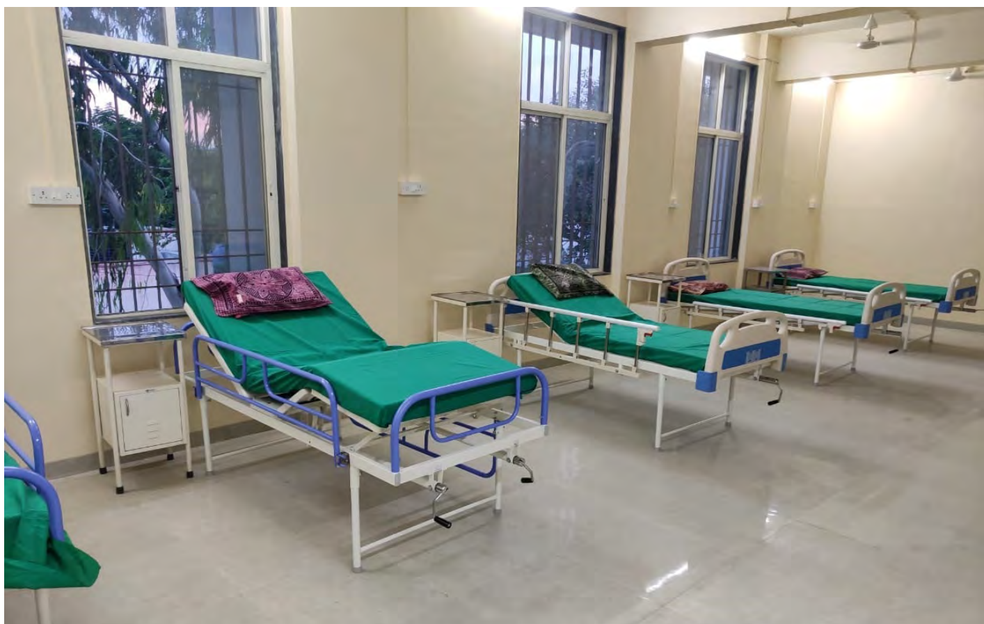
Provided 30 Fowler Beds for COVID Centre at Yawat Government Hospital at Kurkumbh - Maharashtra