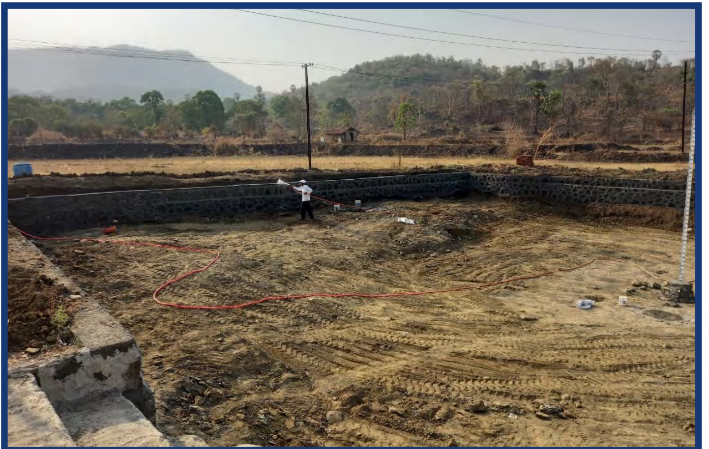
Desilted 5000 m3 from a lake and build safety wall at Posari Village - Patalganga - Maharashtra