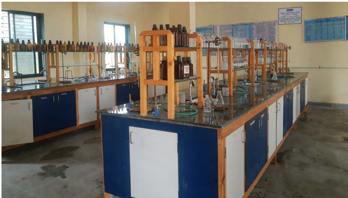
Constructed Chemistry Laboratory room and equipped with required apparatus and chemicals at Parnerkar Maharaj Vidyalaya, Vashivali - Patalganga - Maharashtra