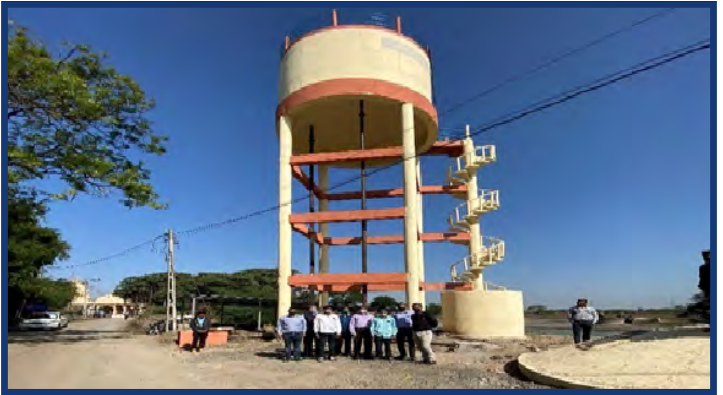
Constructed 50 KL overhead water tank at Vav Village - Dahej - Gujarat