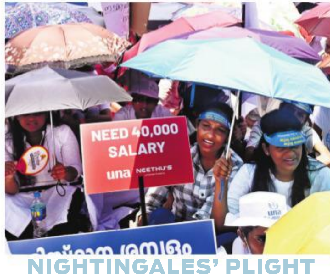
United Nurses Association activists stage a protest in front of the Secretariat on Wednesday raising various demands, including regularisation of jobs, hiking basic monthly salary to Rs 40,000 and ending contract, trainee posts