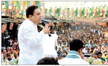
তৃণমূলের প্রতিনিধিদের সঙ্গে ব্রাত্য পেনে করছেন শিক্ষার্থীরা।