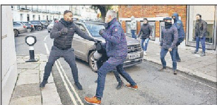
A pro-Palestinian supporter clashes with counter-protesters in London on Saturday.

London's Metropolitan Police said in a post on X, formerly Twitter, that they had faced aggression from counter-protesters who were in the city in "significant numbers", adding that they would not allow