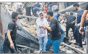
A shell-shocked Palestinian girl is helped after an Israeli strike on a house in Rafah, southern Gaza Strip, on Saturday.

Highlighting the dangers to hospitals on Friday, at least one projectile struck inside the Al-Shifa complex and a video appeared to show people being turned back by gunfire as they tried to evacuate an over-crowded hospital. The strikes and fighting are threatening the lives of hundreds of Palestinians who have sought shelter in Al-Shifa, believing it would be the safest place.