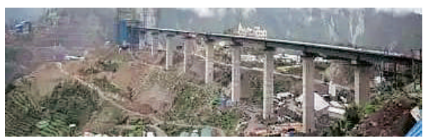
The under-construction railway bridge over Chenab

In an effort to link Kashmir to the rest of the country, the Railways has put the Udhampur-Baramulla project on the fast track. The national transporter is expecting the commissioning of the project by 2021-22, and the completion of the world's highest railway-arch bridge over River Chenab by mid-2020. The project is now being directly monitored by the Prime Minister's Office for its faster completion. Its commissioning was earlier targeted for 2020, but the project got delayed. Of the 272-km Udhampur-Baramulla rail line, nearly 111-km stretch between Katra and Banihal is incomplete. This stretch has around 97-km of tunnels and includes a 359-meter