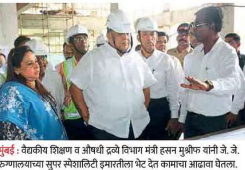
मुंबई : रोकड्याकडे शिष्टाचार देण्यासाठी जे. जे. रुग्णालयाच्या सुपर स्पेशलिटी इमारतीला मुदतवाढ देण्यात आली आहे. मंत्री हसन मुश्रीफ यांनी जे. जे. रुग्णालयाला भेट देऊन सुपर स्पेशलिटी इमारतीच्या बाबतची माहिती घेतली.

मुंबई, ता. २८ : जे. जे. रुग्णालयाच्या सुपर स्पेशलिटी इमारतीला मुदतवाढ देण्यात आली आहे. मंत्री हसन मुश्रीफ यांनी जे. जे. रुग्णालयाला भेट देऊन सुपर स्पेशलिटी इमारतीच्या बाबतची माहिती घेतली. हसन मुश्रीफ यांनी जे. जे. रुग्णालयाच्या सुपर स्पेशलिटी इमारतीच्या बाबतची माहिती घेतली. हसन मुश्रीफ यांनी जे. जे. रुग्णालयाच्या सुपर स्पेशलिटी इमारतीच्या बाबतची माहिती घेतली.