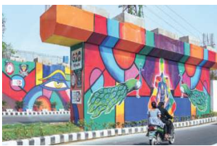
Commuters pass by a mural designed in preparation for the G20 Summit near Pragati Maidan in Delhi

To ensure safety and assistance, Delhi Police and the office of the Lieutenant Governor of Delhi have deployed a specialised group of 400 officers known as "tourist police" in newly acquired Bolo vehicles across 12 locations. These locations include landmarks like Humayun's Tomb, Lotus Temple, Red Fort, Jama